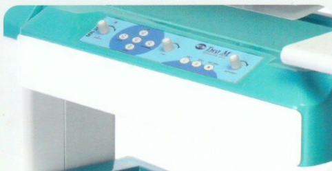
Trail Set Storage