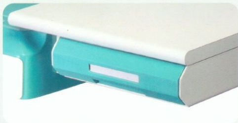
Writing Table With Mini Storage